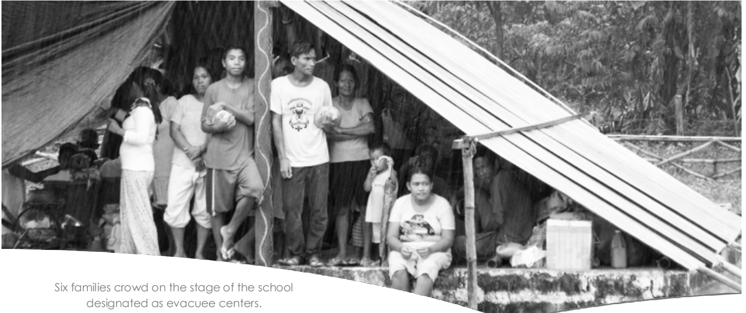
Six families crowd on the stage of the school designated as evacuee centers. See more pictures and actual news on facebook – Pasali Philippines.